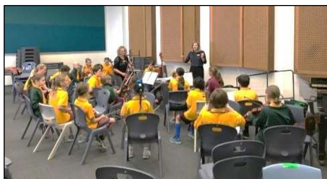
The Green Room