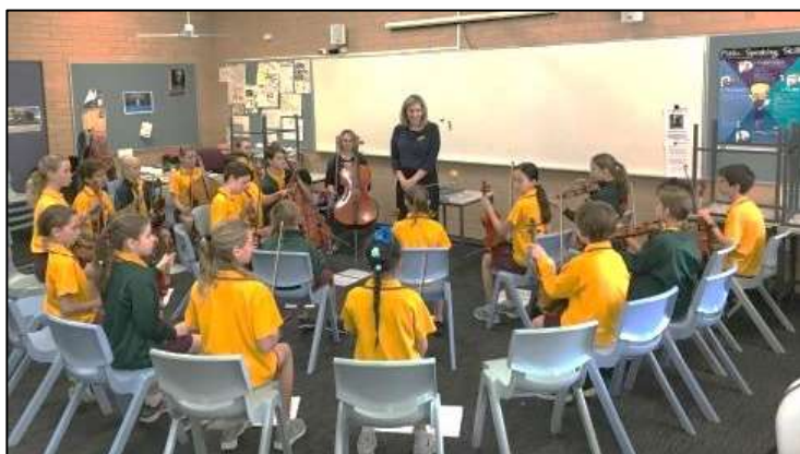
The Practice Room

Awarded "EXCELLENT" for their performance